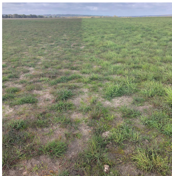
Figure 2. Visual response to treatment (RHS)

Foliar treatments were then applied (2 different timings) and plant biomass measured prior to grazing.